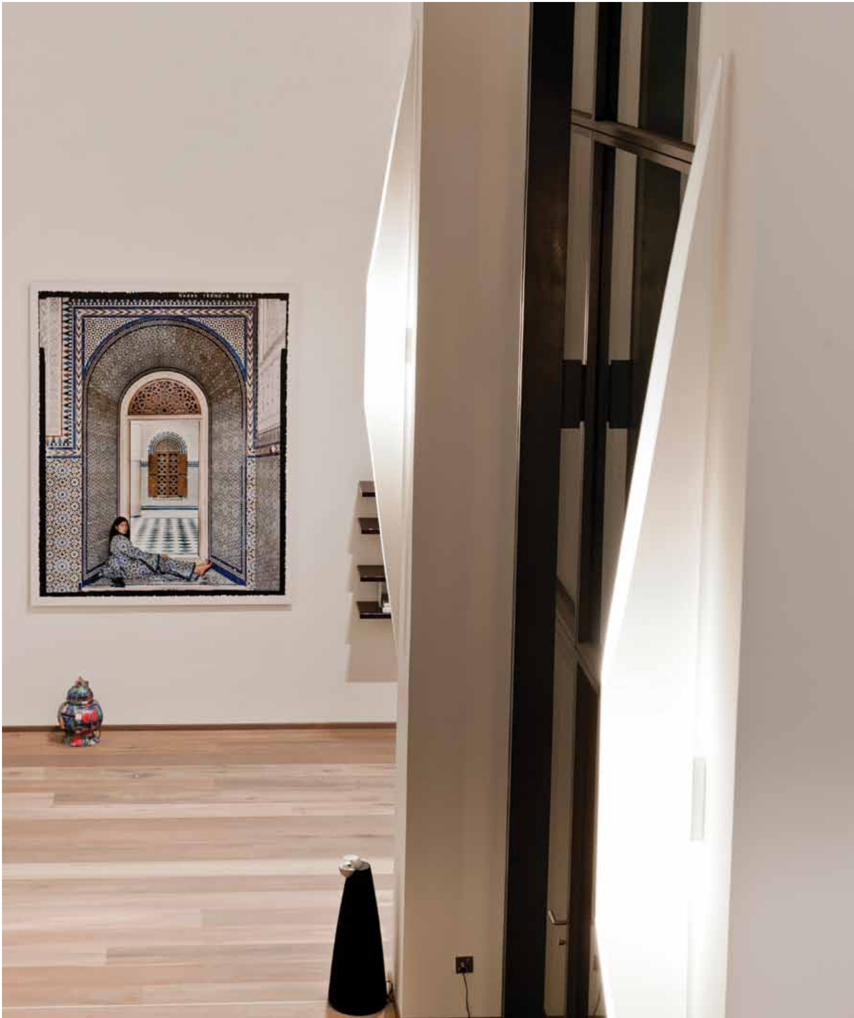
IMPRESSIONS OF THE MIDDLE EAST A stunning painting by Syrian artist Lalla Essaydi hangs elegantly on a lounge wall and is allowed to breathe, uncluttered by excess furniture or ornamentation